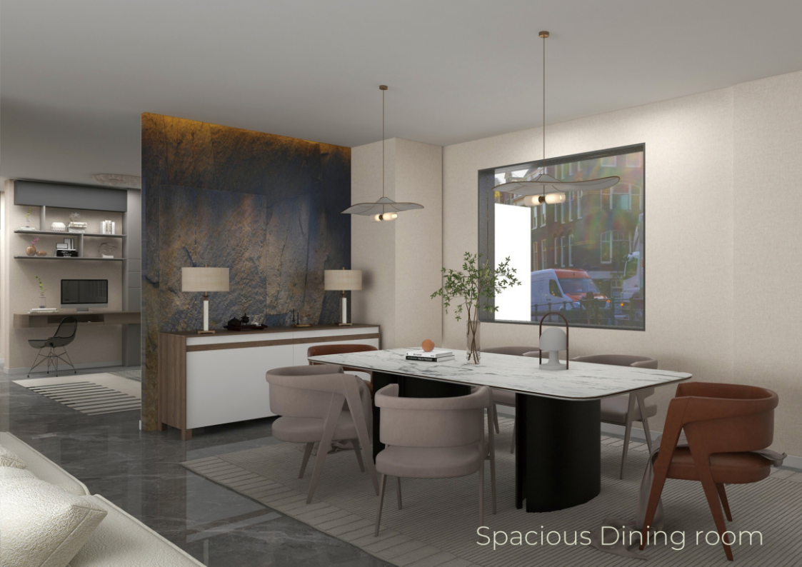
Spacious Dining room