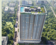
Oak West Residency 1&2&3 Bedroom Westlands (under construction)