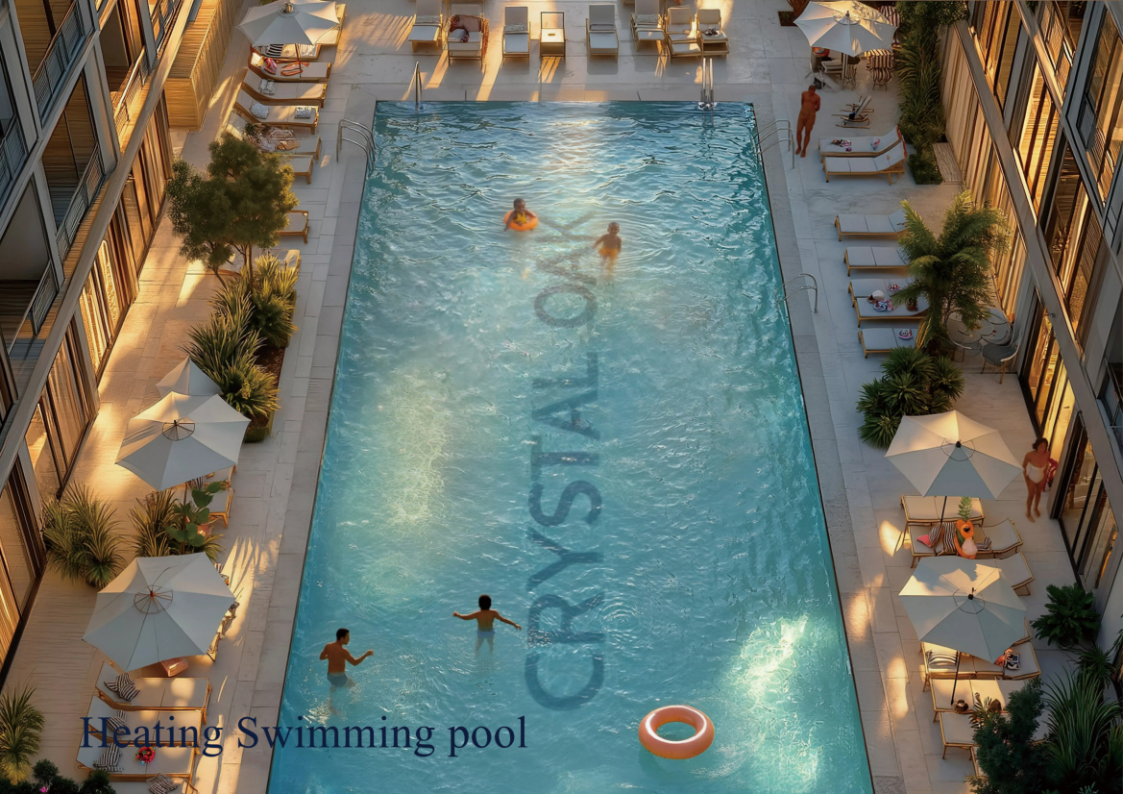
Heating Swimming pool