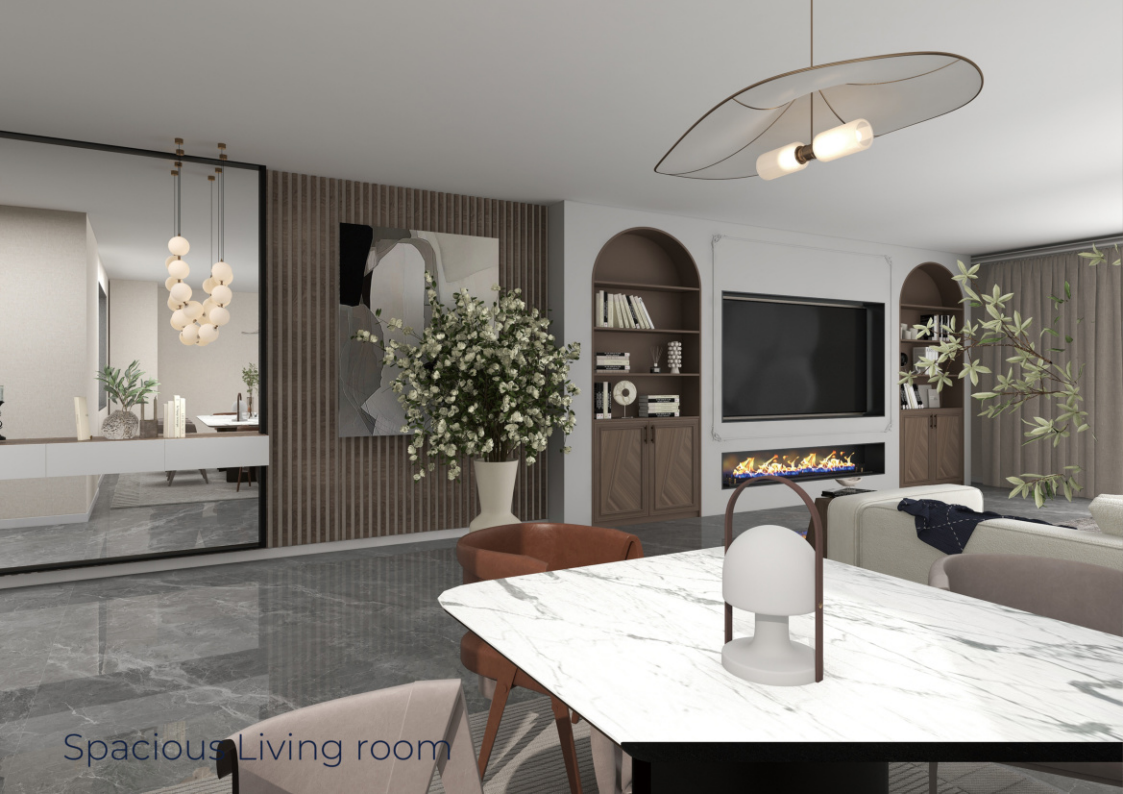
Spacious Living room