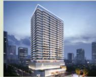
Oak Breeze Residency 1&2 Bedroom Kilimani (under construction)